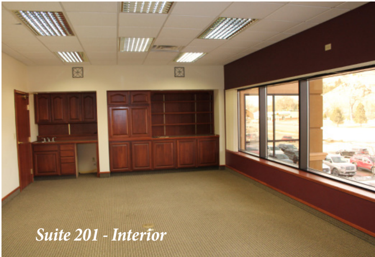
Suite 201 - Interior