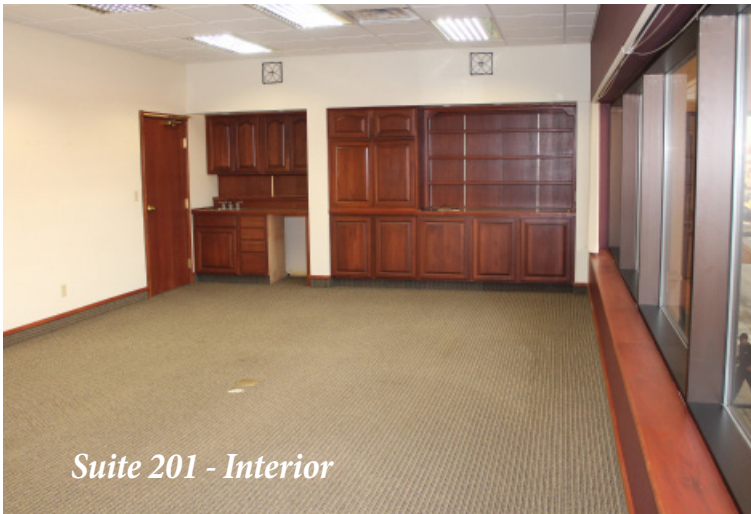
Suite 201 - Interior